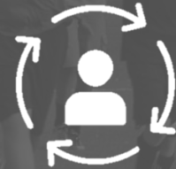
End to end Management