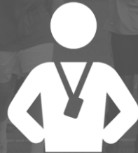
Training of PTIs